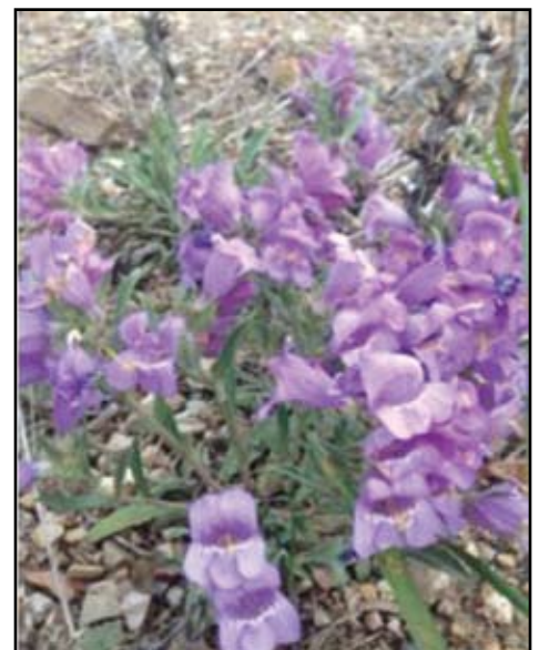
Captions: (left to right) Wild Montana plant exhibit with Pretty Shooting Star, Golden Pea, and Fuzzytongue Penstemon