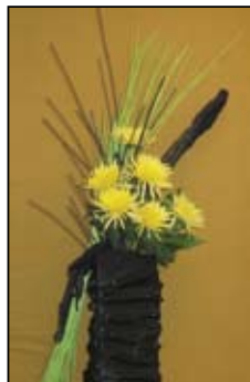
Pictured: (Left) Flower Show School April Class. (Right) Creative Floral Design.