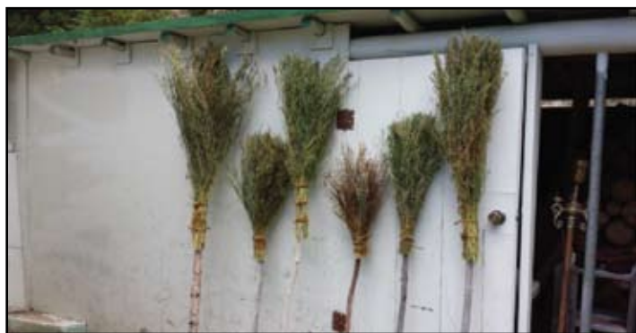
Pictured top right: Decorating gourds, scary dolls and witches brooms for the Haunted Mine Tour.